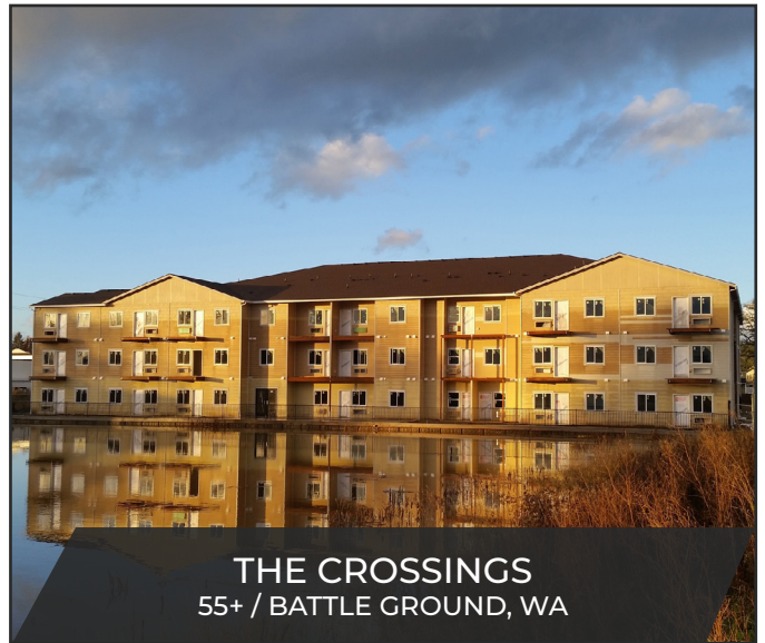
THE CROSSINGS 55+ / BATTLE GROUND, WA