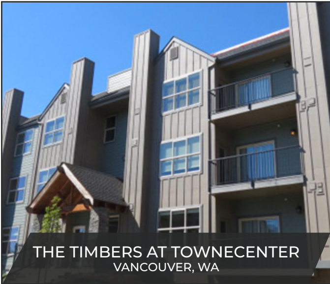
THE TIMBERS AT TOWNCENTER VANCOUVER, WA