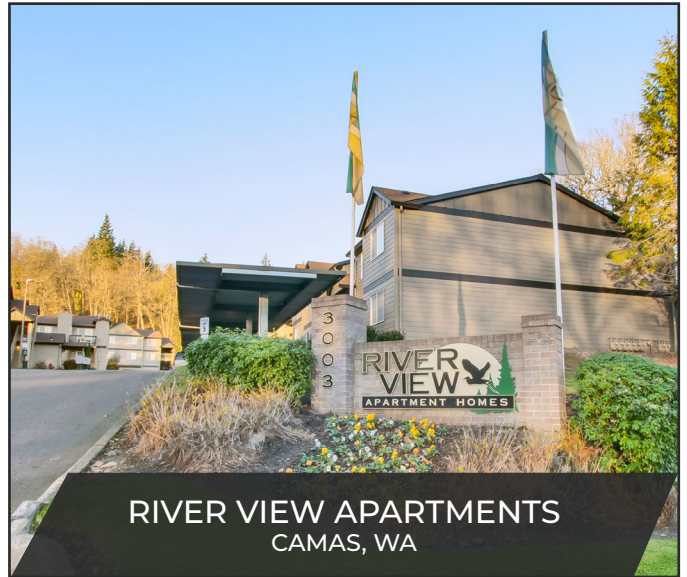
RIVER VIEW APARTMENTS CAMAS, WA