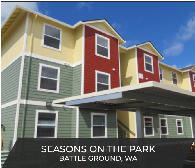
SEASONS ON THE PARK BATTLE GROUND, WA