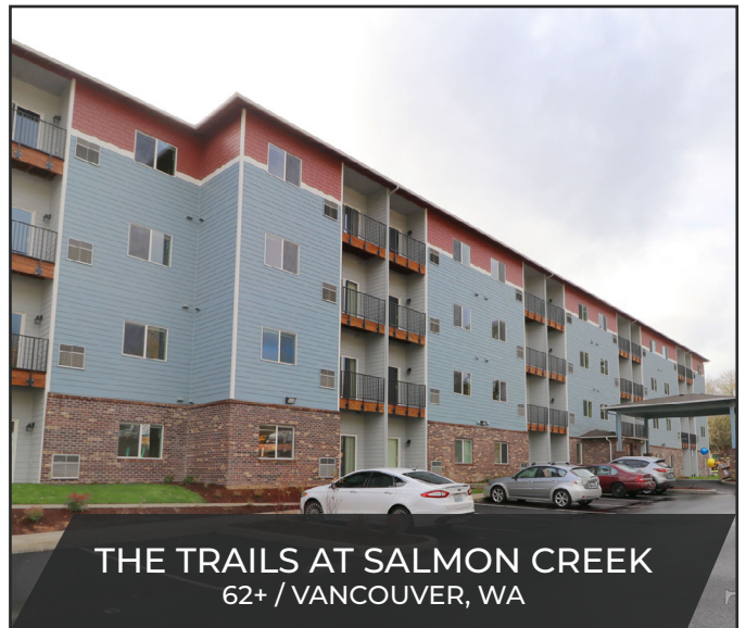
THE TRAILS AT SALMON CREEK 62+ / VANCOUVER, WA